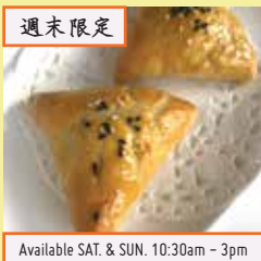
週末限定 金牌叉燒酥 Cha Siu So BBQ Pork Pastry (M)