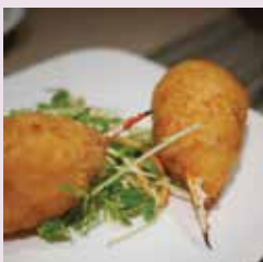
百花釀蟹鉗 Stuffed Crab Claws Crab Claws Stuffed with Grounded Shrimp (SP)