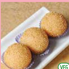
VEG 豆沙芝麻球 Sesame Ball Fried Rice Flour Ball with Red Bean Paste (S)