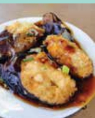
煎釀茄子 Stuffed Eggplant Pan Fried Eggplant Stuff with Grounded Shrimp (L)