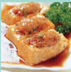
煎釀豆腐 Stuffed Tofu Pan Fried Tofu Stuffed with Chopped Shrimp (L)