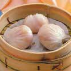
晶瑩鮮蝦餃 Har Gow Shrimp Dumplings (L)