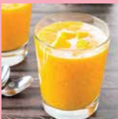
楊枝甘露 Mango Pomelo Sago House Made Fresh Mango, Grapefruit & Tapioca (L)