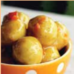
咖喱魚蛋 Curry Fish Ball Steamed in Curry Sauce (L)