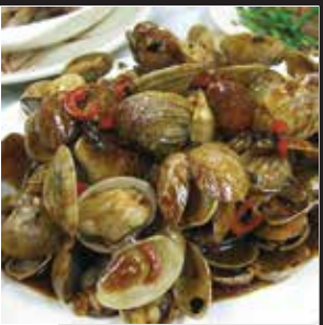
豉椒炒蜆 Clams Blk Bean Sauce $14.95