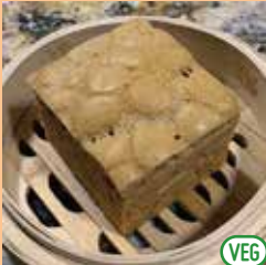
VEG 古法馬拉糕 Sponge Cake Brown Sugar, Milk, Egg and Flour (S)