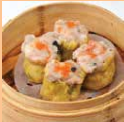
泰潮燒賣皇 Siu Mai Pork & Shrimp Dumplings (L)