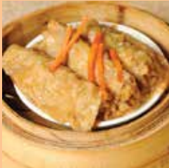
蠔皇鮮竹卷 Steamed Bean Curd Rolls Pork, Shrimp Stuffed Bean Curd Rolls (M)