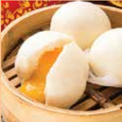
黃金流沙包 Custard Bun Lightly Sweet, Creamy Custard Bun (M)