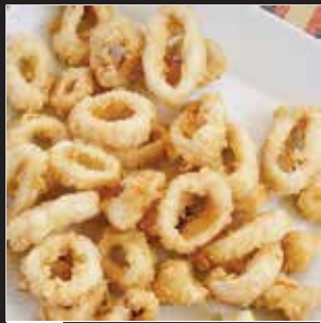
酥炸鮮魷 Fried Calamari $14.95