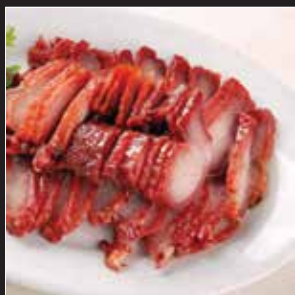
蜜汁叉燒 Roasted Pork $14.95