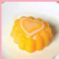
香芒凍布丁 Mango Pudding House Made Fresh Mango Pudding (M)