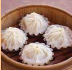
上海小籠包 Xiao Long Bao Mini Steamed Soup Pork Buns (M)