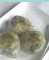
韭菜煎蝦餅 Gin Har Bang Pan Fried Shrimp & Chive Dumplings (L)