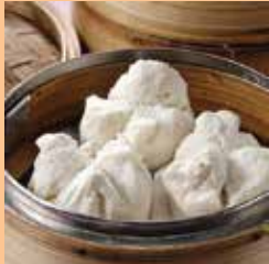
薑蔥雞包仔 Gai Bao Chicken, Shrimp, Mushroom Steamed Buns (L)