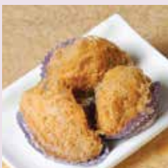
蜂巢荔芋角 Taro Puff Stuffed with Minced Pork & Taro (M)