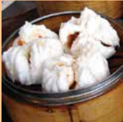
蜜汁叉燒包 Cha Siu Bao BBQ Pork Steamed Buns (L)