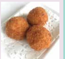
黃金炸蝦球 Fried Shrimp Balls Grounded Shrimp & Rolled into Balls (L)