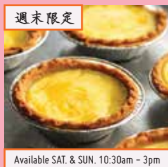
週末限定 迷你蛋撻仔 Egg Tarts Baked Lightly Sweet Pastry (M)