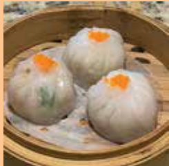
魚子蟹肉餃 Crabmeat Dumplings Dumplings Stuffed with Real Crabmeat (SP)