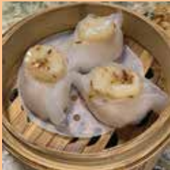
XO帶子餃 Scallop Dumplings Sea Scallops, Shrimp and XO sauce (SP)