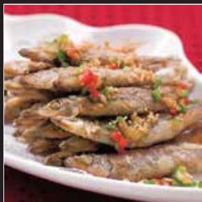
椒鹽多春魚 Peppercorn Smelt $14.95