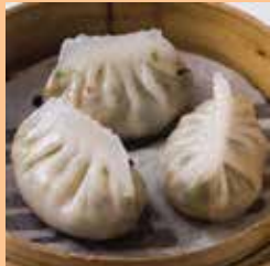
潮州小粉果 Chiu Chow Dumplings Mined Pork, Shrimp & Peanut Dumplings (L)