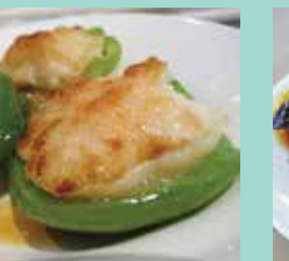
煎釀青椒 Stuffed Pepper Pan Fried Pepper Stuff with Grounded Shrimp (L)