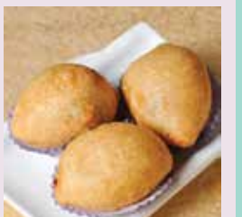
五香鹹水角 Ham Sui Gok Deep Fried Sticky Rice and Pork Dumplings (S)