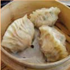
鮮蝦香茜餃 Hung Sai Gow Shrimp & Cilantro Dumplings (L)