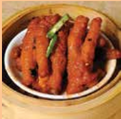
豉汁蒸鳳爪 Chicken Feet Steamed with Black Bean Sauce (L)