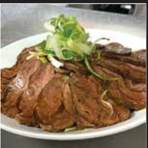
五香牛腱 Five Spices Beef Shank $14.95