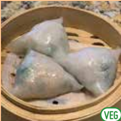
VEG 山竹豆苗餃 Pea Tip Dumplings Vegetarian Favorites, with Bean Curd & Pea Tip Leaves (L)