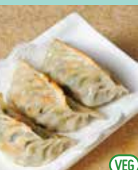
香煎素鍋貼 Veg Potsticker Pan Fried Veggie Dumplings (S)