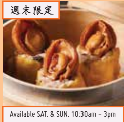
週末限定 鮑魚燒賣皇 Abalone Siu Mai Siu Mai Topped with Whole Abalone (SP)