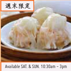
週末限定 鵪鶉蛋燒賣 Quail Eggs Siu Mai Siu Mai Topped with Quail Eggs (XL)