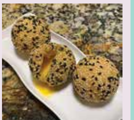
黃金流沙球 Fried Custard Balls Fried Rice Flour Balls with Custard Fillings(L)