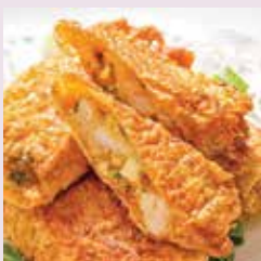
鮮蝦腐皮卷 Fried Bean Curd Rolls Shrimp Wrapped Bean Curd Roll (L)