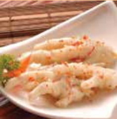
白雲鳳爪 Spicy Chicken Feet Chicken Paws in Chinese Marinade (L)