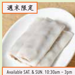
週末限定 牛肉腸粉 Beef Chang Fun Steamed Beef Rice Roll (L)