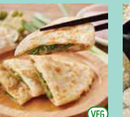
VEG 家鄉蔥油餅 Scallion Pancake Pan Fried Pancakes (S)