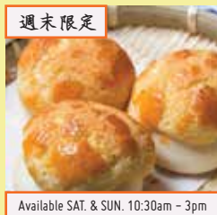
週末限定 波蘿奶皇包 Ball Law Bao Baked Custard Bun (M)