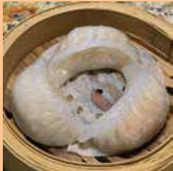
XO金菇餃 XO Enoki Dumplings Shrimp, Celery, Carrots & Enoki Mushroom (L)