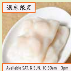
週末限定 鮮蝦腸粉 Shrimp Chang Fun Steamed Shrimp Rice Roll (XL)