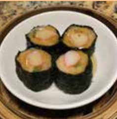
日式紫菜卷 Seaweed Shrimp Roll Celery & Shrimp rolled with Seaweed (L)