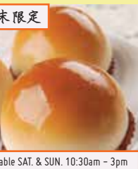
週末限定 焗叉燒餐包 Baked Pork Bun BBQ Pork Baked Bun (M)