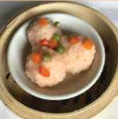
百花蒸蝦丸 Shrimp Balls Grounded Shrimp & Rolled into Balls (L)