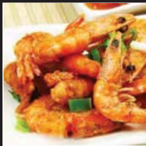
椒鹽有頭蝦 Peppercorn Shrimp $14.95