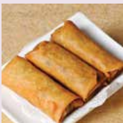
脆皮蝦春卷 Ty Spring Rolls Stuffed with Pork and Shrimp (L)