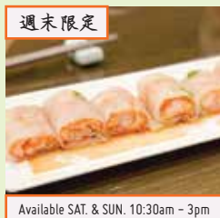
週末限定 春風得意腸 Special Chang Fun Steamed Rice Roll, wrapped with Beancurd Sheet and Shrimp (SP)