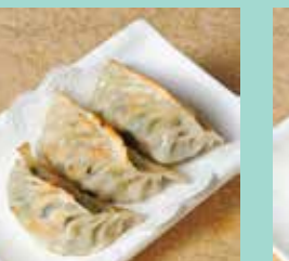
京都鍋貼餃 Potsticker Pan Fried Pork Dumplings (S)