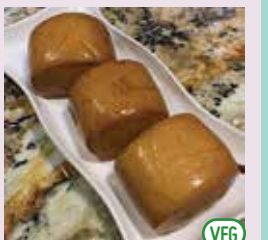
VEG 迷你炸饅頭 Mini Fried Buns Deep Fried Mini Buns (S)