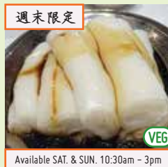
週末限定 白腸粉 Plain Chang Fun Steamed Plain Rice Roll (M)