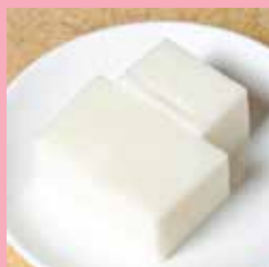
香滑椰汁糕 Coconut Pudding House Made Coconut Pudding (S)