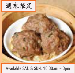
週末限定 山竹牛肉球 Beef Meat Balls Grounded Beef Rolled into Balls (M)