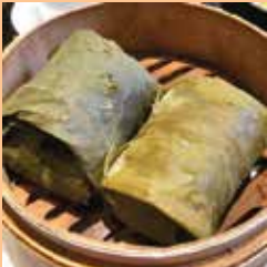
荷葉珍珠雞 Sticky Rice Lotus Leaf Pork, Sausage, Egg, Sticky Rice Wrapped in Louts Leaf (XL)