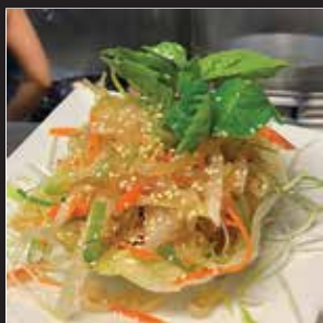
涼伴海蜇 Jelly Fish $14.95