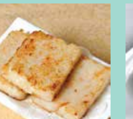
臘味蘿蔔糕 Turnip Cake Pan Fried Turnip Cake (M)