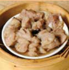
豉汁蒸排骨 Pork Spare Ribs Steamed with Black Bean Sauce (L)