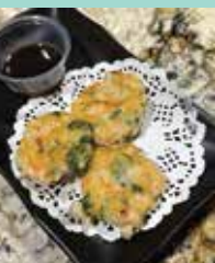
煎墨魚蝦餅 Shrimp Cake Pan Fried Grounded Shrimp Cake with Diced Calamari (L)