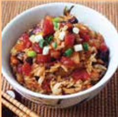
臘味糯米飯 Sticky Rice Bowl Pork, Sausage, Mushroom, Peanuts, Dried Shrimp (XL)