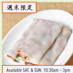
週末限定 叉燒腸粉 Pork Chang Fun Steamed Rice Roll with BBQ Pork (L)