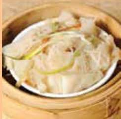
薑蔥牛佰葉 Beef Omasum Steamed with Ginger & Scallion (XL)