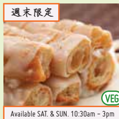
週末限定 特式炸兩 Zha Liang Steamed Rice Roll with Fried Donut (L)