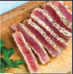
香煎吞拿魚 Seared Ahi Tuna $14.95