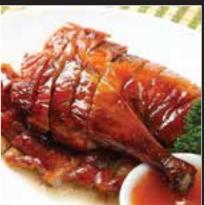
明爐烤鴨 Roasted Duck $14.95